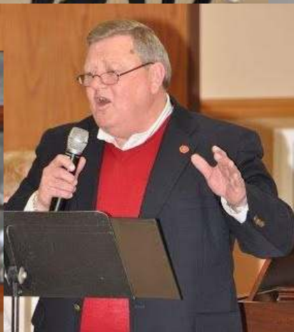
Everyone had a wonderful time at the All Church Talent Show and Chili Feed.