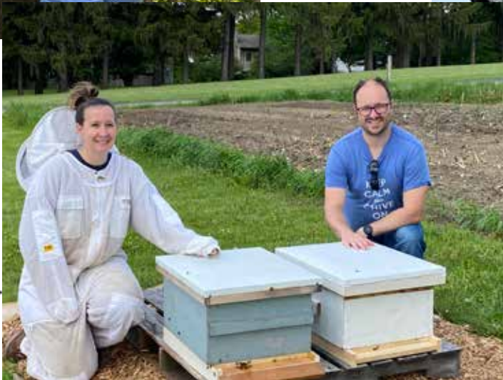
The beehives being installed at CPC!