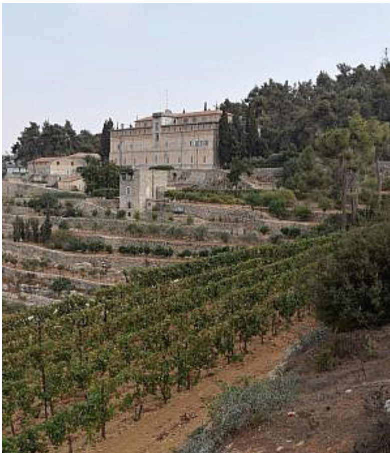
Cremisan vineyard between Jerusalem and Bethlehem.